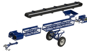
Easy assembly modular design for added shipping and storage convenience