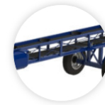
FLAT BELT PORTABLE CONVEYOR CONV-24