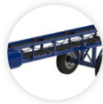
FLAT BELT PORTABLE CONVEYOR CONV-20